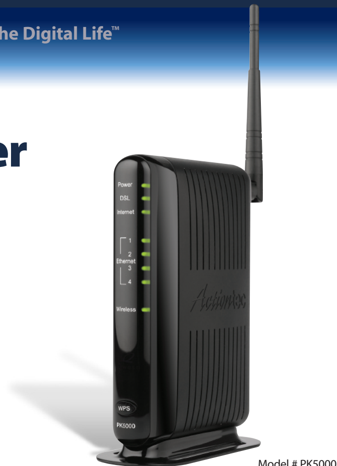
Model # PK5000